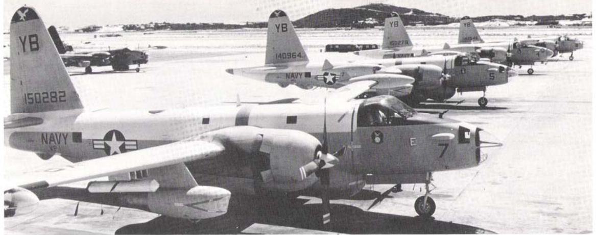
(Above) SP-2H (P2V-7S) (150282) of VP-1, was next to the last Lockheed built Neptune and is parked on the flightline of the Naval Air Facility at Cam Ranh Bay, Vietnam. These aircraft served into the early 1970s. 9 September 1968

The caption under the photo of the P2s has us located in DaNang in 1969, when in fact this photo was taken where we actually were located, which was NAF Cam Ranh Bay. The photo was taken on 9 September 1968, but that's ok, we were still there in '69.